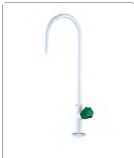
ONE WAY WATER TAP