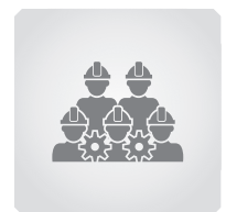
45 SKILLED WORKERS