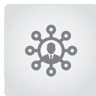
MANAGEMENT EXECUTIVE TEAM