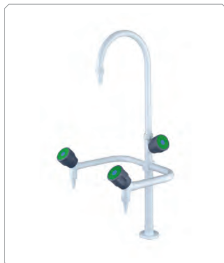
THREE WAY WATER TAP