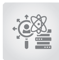
EXPERIENCED R&D PERSONNEL