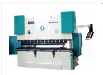
CNC PRESS BRAKE

We believe to deliver superior quality of the products that is why Neptune has developed in house atomization for all sheet metal work process. Our latest technologies to improve the product finishing up to end by Automatic machines like Fibre laser cutting machine, CNC press break machine, Shearing (Cutting) machine, Mig welding machine for MS, Invertor Argon welding machine for SS, Bending roll machine etc.. Innovation @ every step is our mission to increase our quality standard day by day.