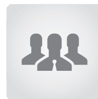
SALES & MARKETING PROFESSIONALS